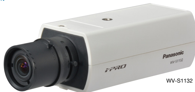
Lens : Optional